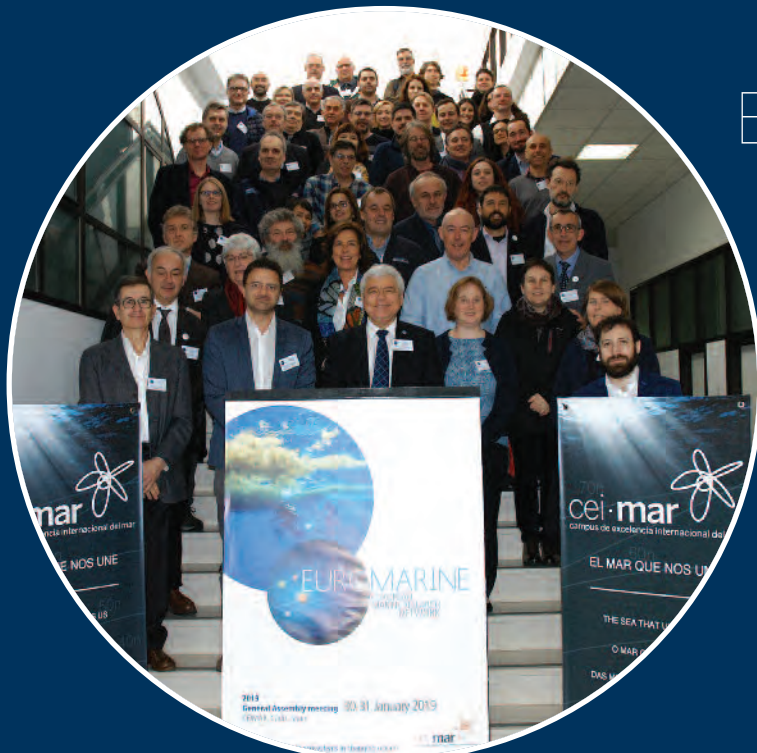
EuroMarine 2019 General Assembly meeting, Cádiz, Spain.